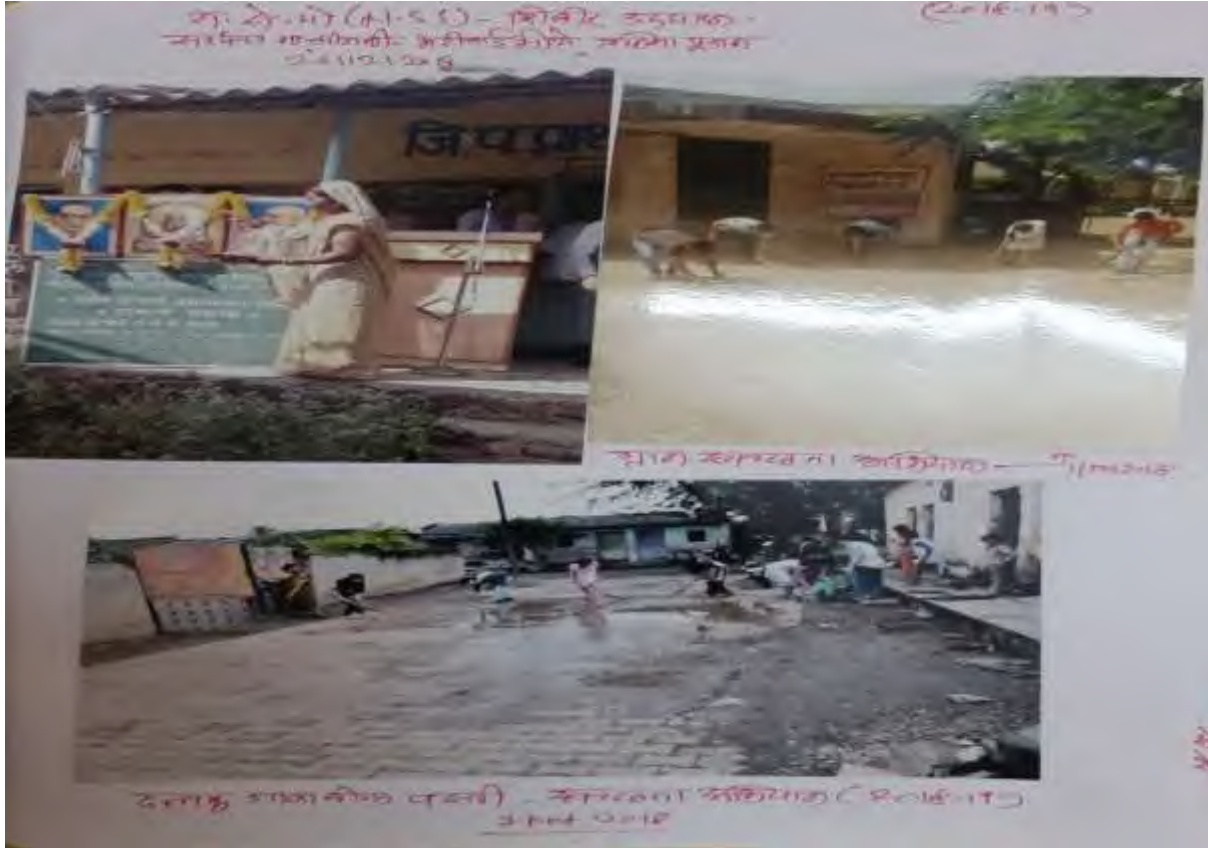
Students involved in cleanness activity at Bodhagaon Tal- Sakri Dist-Dhule.