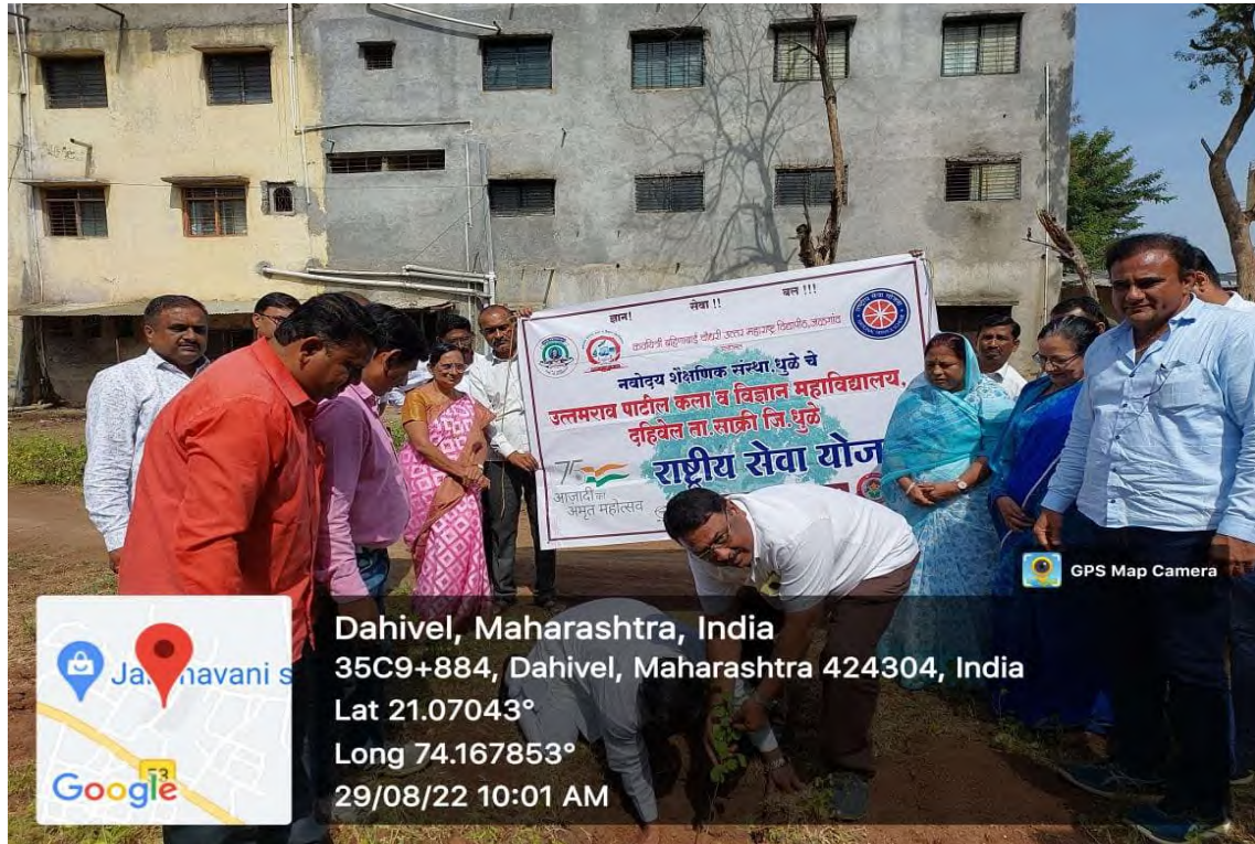
The Faculty of U.P. College planting tress under Tree Plantation Drive on 29/08/2022