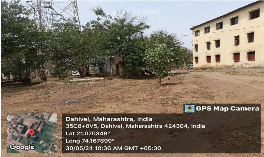
Trees Near the College Entrance -