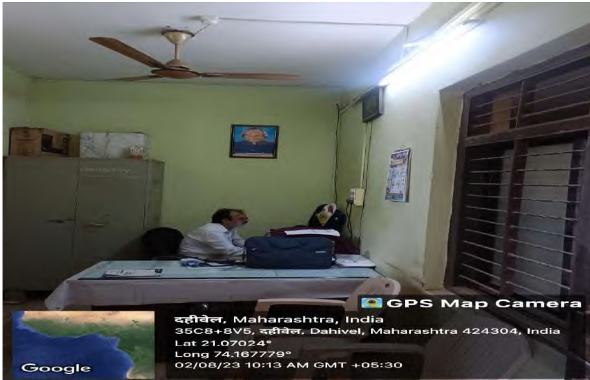
Department of Chemistry