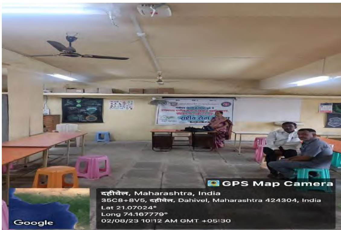
Department of Botany Lab