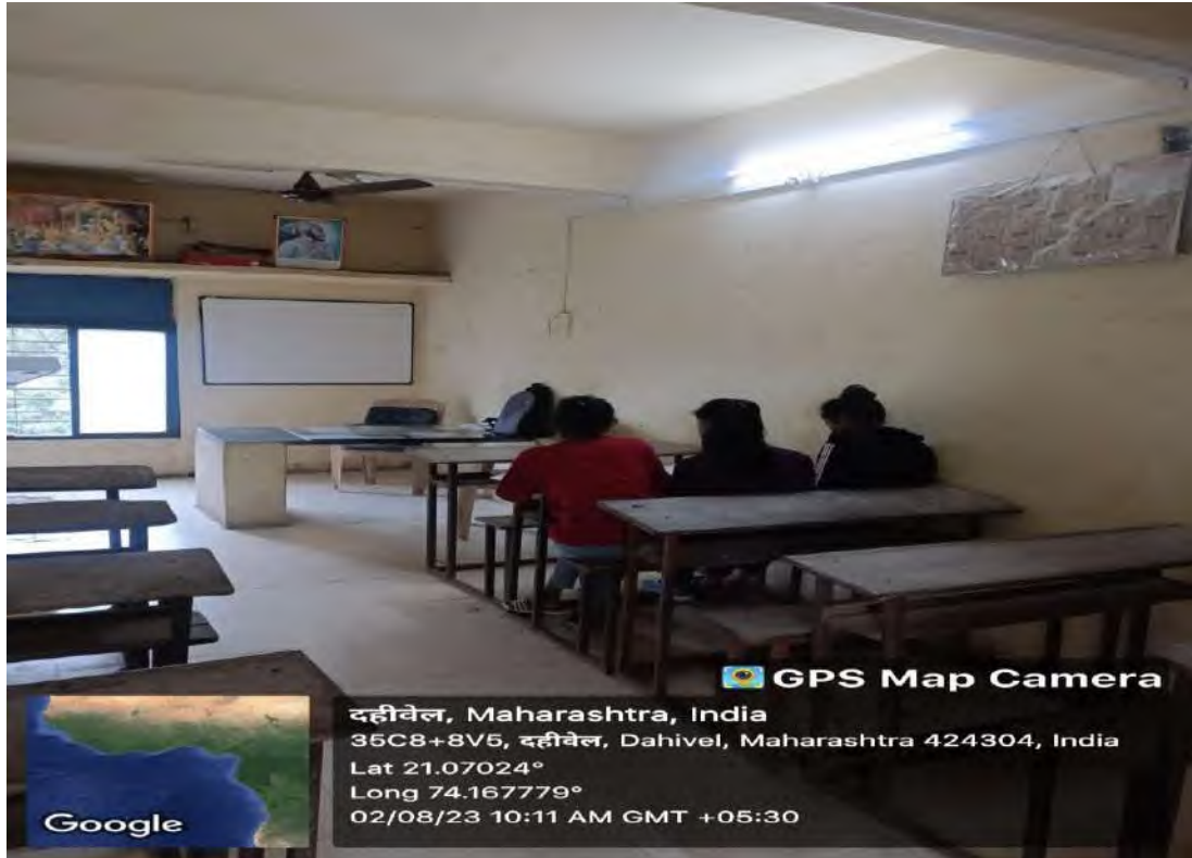
Department of History